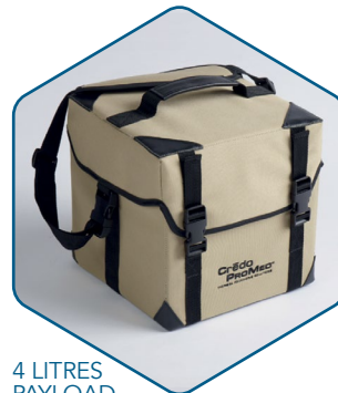
4 LITRES PAYLOAD